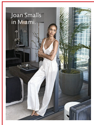
Joan Smalls in Miami.