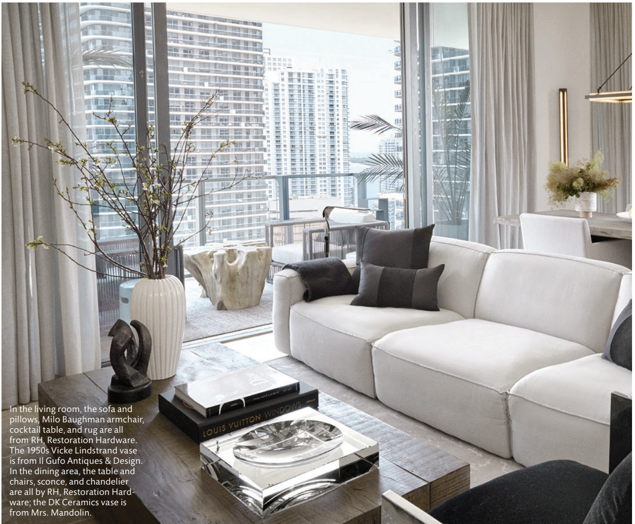
In the living room, the sofa and pillows, Milo Baughman armchair, cocktail table, and rug are all from RH, Restoration Hardware. The 1950s Vicke Lindstrand vase is from Il Gufo Antiques & Design. In the dining area, the table and chairs, sconce, and chandelier are all by RH, Restoration Hardware; the DK Ceramics vase is from Mrs. Mandolin.