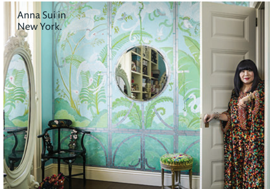
Anna Sui in New York.