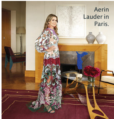
Aerin Lauder in Paris.