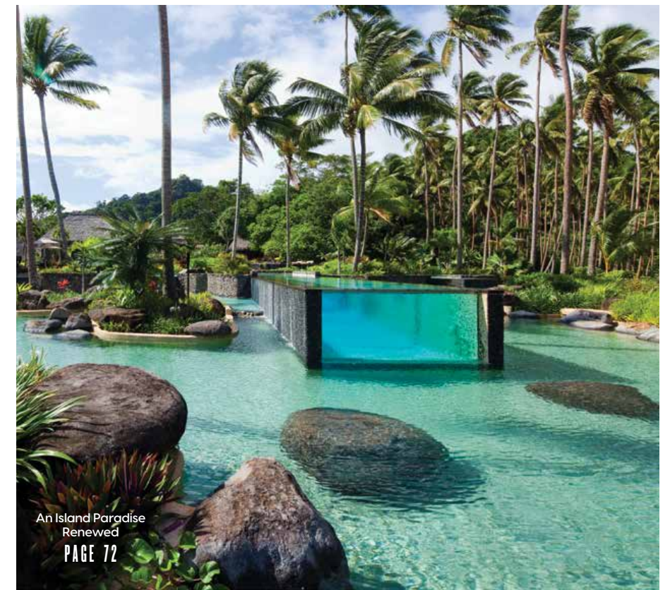
An Island Paradise Renewed PAGE 72

A new documentary captures the life and work of the late fashion icon, Alexander McQueen.