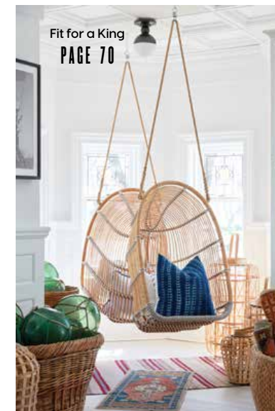
Fit for a King PAGE 70