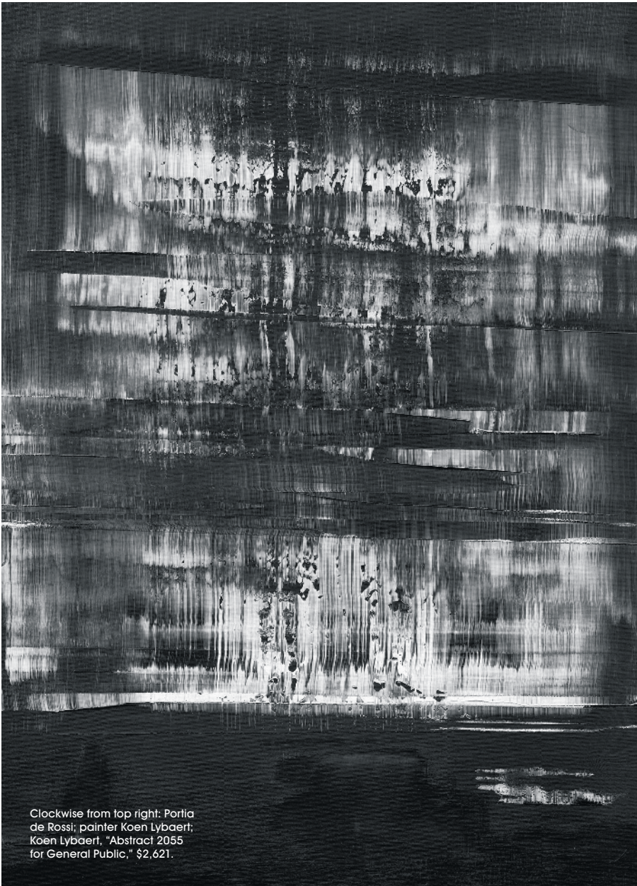
Clockwise from top right: Portia de Rossi; painter Koen Lybaert; Koen Lybaert, "Abstract 2055 for General Public," $2,621.