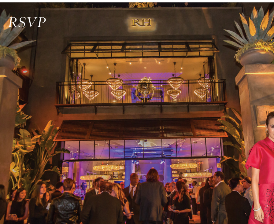
Revelers at the entrance to RH West Hollywood.