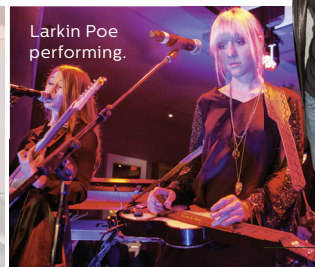
Larkin Poe performing.