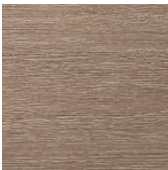
Finished Teak - Weathered finish (new)