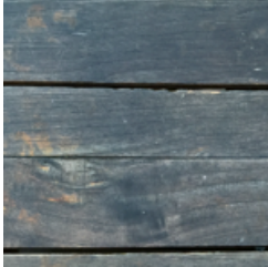
Natural Teak (at 1 year, left uncovered)