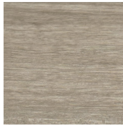
Natural Teak (at 1 year)