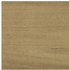
Natural Teak (at 6 months)