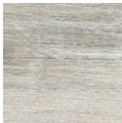
Finished Teak - Weathered finish (at 5 years)