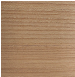
Natural Teak (new)