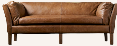
7', 8' and 9' Sofa*