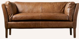
5' and 6' Sofa*