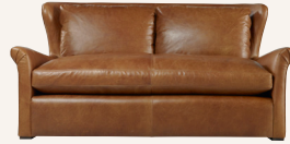
6' and 7' Sofa