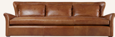
8', 9' and 10' Sofa; 7' Sleeper Sofa