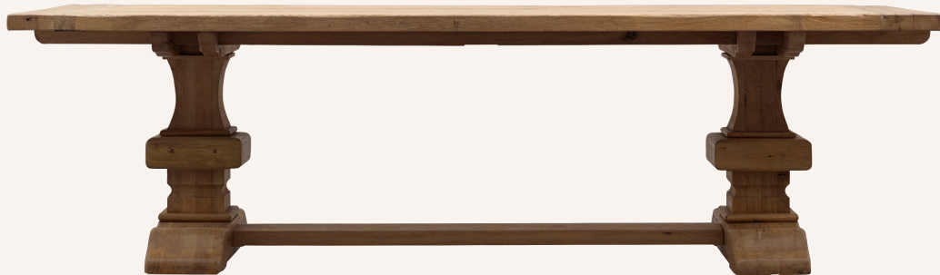
120" Rectangular Extension Table