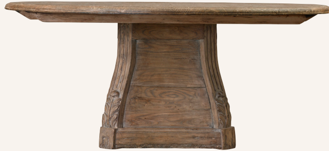
72" Round Table