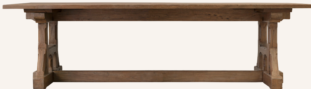
108" Rectangular Table