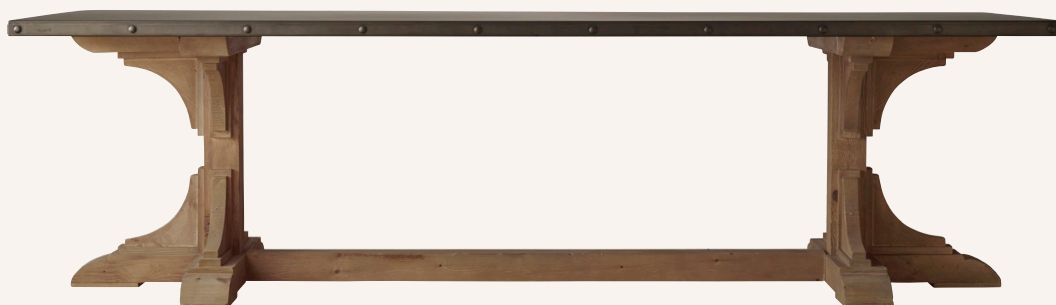
108" Rectangular Table