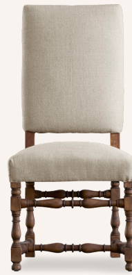
Side Chair with Belgian Linen