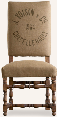
Printed Burlap Side Chair (Also available in Solid Burlap)