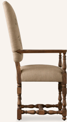
Printed Burlap Armchair (Also available in Solid Burlap)