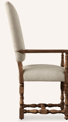
Armchair with Belgian Linen