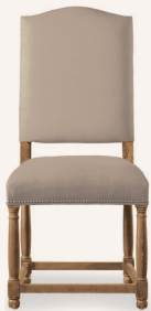
Camelback Side Chair