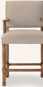
Parsons Counter Stool