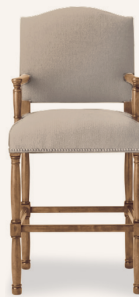
Camelback Counter Stool