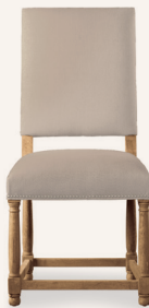
Parsons Side Chair