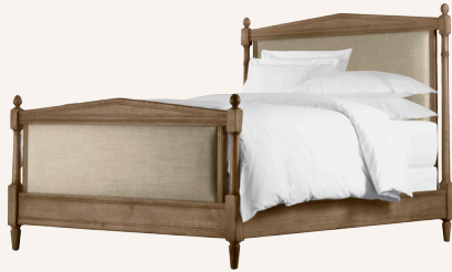
Bed With Footboard