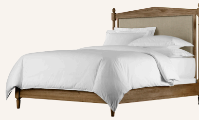
Bed Without Footboard