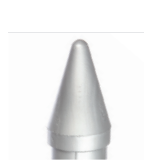
Triton Polymer Finial