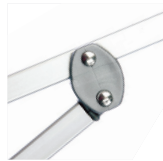
Marine Satin Anodized Finish