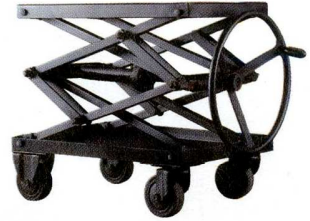
TOP SHOP Houston's new Gallery will have a look similar to its L.A. sister site, with items like the Scissor Lift table, above.