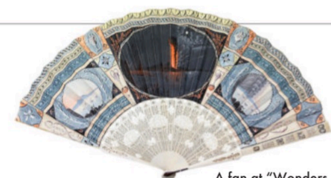
A fan at "Wonders of the Grand Tour."

ART WALK The impressive Museo Poldi Pezzoli was once the home of Gian Giacomo Poldi Pezzoli, a collector of Renaissance decorative arts. He died in 1879 and bequeathed his house and collection to the city, forming the museum as it stands today. Throughout the week, "Wonders of the Grand Tour," organized with the Metropolitan Museum of Art, will spotlight Baroque painter Giovanni Paolo Panini's celebrated views of Rome.