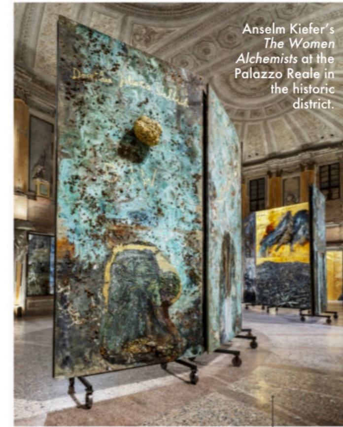
Anselm Kiefer's The Women Alchemists at the Palazzo Reale in the historic district.

ART WALK The impressive Museo Poldi Pezzoli was once the home of Gian Giacomo Poldi Pezzoli, a collector of Renaissance decorative arts. He died in 1879 and bequeathed his house and collection to the city, forming the museum as it stands today. Throughout the week, "Wonders of the Grand Tour," organized with the Metropolitan Museum of Art, will spotlight Baroque painter Giovanni Paolo Panini's celebrated views of Rome.