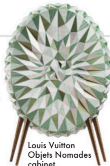
Louis Vuitton Objets Nomades cabinet, louisvuitton.com

BRAND AWARENESS Fashion houses are everywhere at Milan Design Week. Many activate existing flagships, including Louis Vuitton , which will unveil new iterations of Art Deco-inspired designs, and Issey Miyake , collaborating with Spanish architects Ensemble Studio. Finnish brand Marimekko will host "Osteria Fiori" in a historic Milanese restaurant, while Golden Goose will stage a sports-led pop-up with padel tournaments.