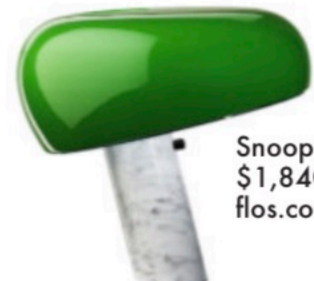
Snoopy lamp, $1,840, flos.com

Alcova is where independent designers, emerging brands, and boundary-pushing galleries present their work. This year the exhibition takes place in two historic sites on the western edge of the city. The larger is Baggio Military Hospital , a vast abandoned medical complex dating from the 1930s. The other location is Villa Pestarini , a Modernist private home designed by the architect Franco Albini and completed in 1939. Opening to the public for the first time, the villa is expected to be one of the most sought-after visits of the week, so make sure to book your tickets ahead of time.