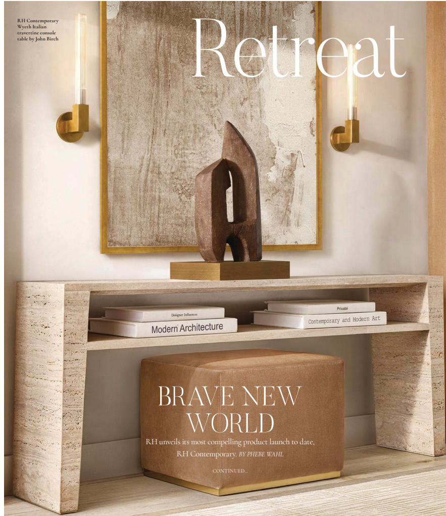
RH Contemporary Wyeth Italian craqueline console table by John Birch