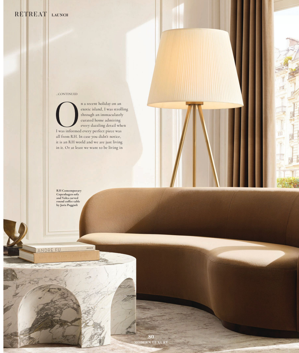
RH Contemporary Copenhagen sofa and Volta carved round coffee table by Joris Poggiani

O n a recent holiday on an exotic island, I was strolling through an immaculately curated home admiring every dazzling detail when I was informed every perfect piece was all from RH. In case you didn't notice, it is an RH world and we are just living in it. Or at least we want to be living in