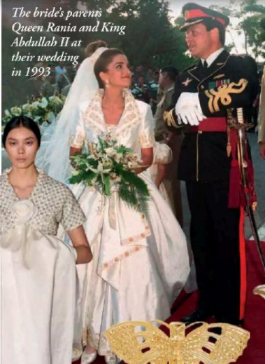
The bride's parents Queen Rania and King Abdullah II at their wedding in 1993