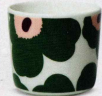
Marimekko cup, $39/2; marimekko.com.