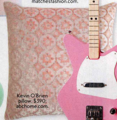
Kevin O'Brien pillow, $390; abchome.com.