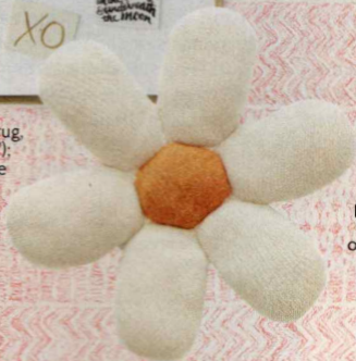
Oeuf pillow, $80; oeufnyc.com.