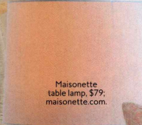
Maisonette table lamp, $79; maisonette.com.