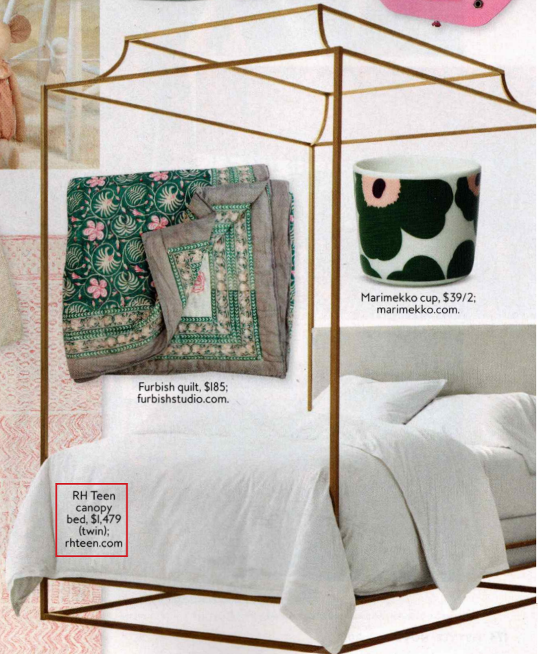
Furbish quilt, $185; furbishstudio.com.