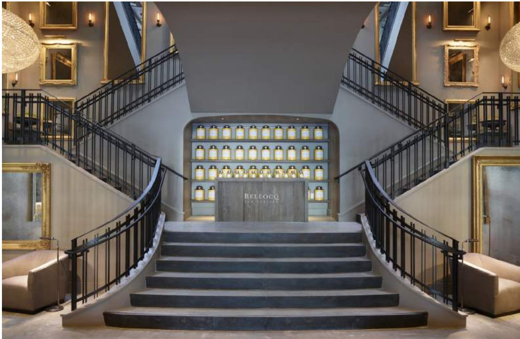
Level 1 - The grand double staircase features custom-designed iron handrails inspired by the late 20th-century Venetian architect, Carlo Scarpa, and a Bellocq Organic Tea Atelier.