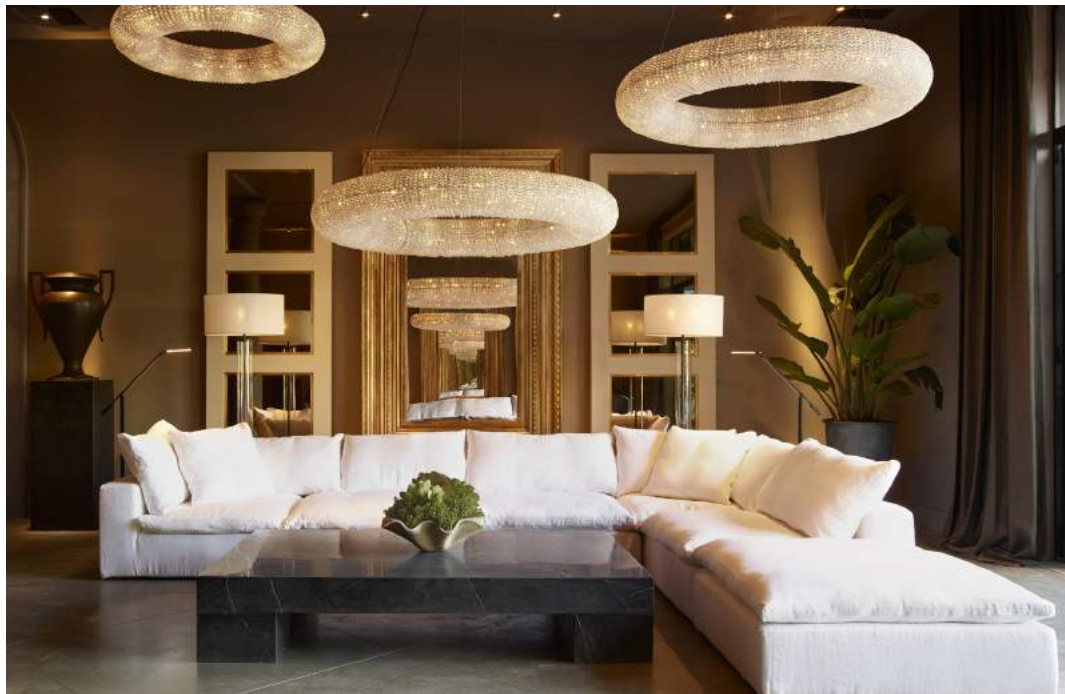
Level 1- The grand entry's central hall with 14-foot ceilings showcases dramatic installations.