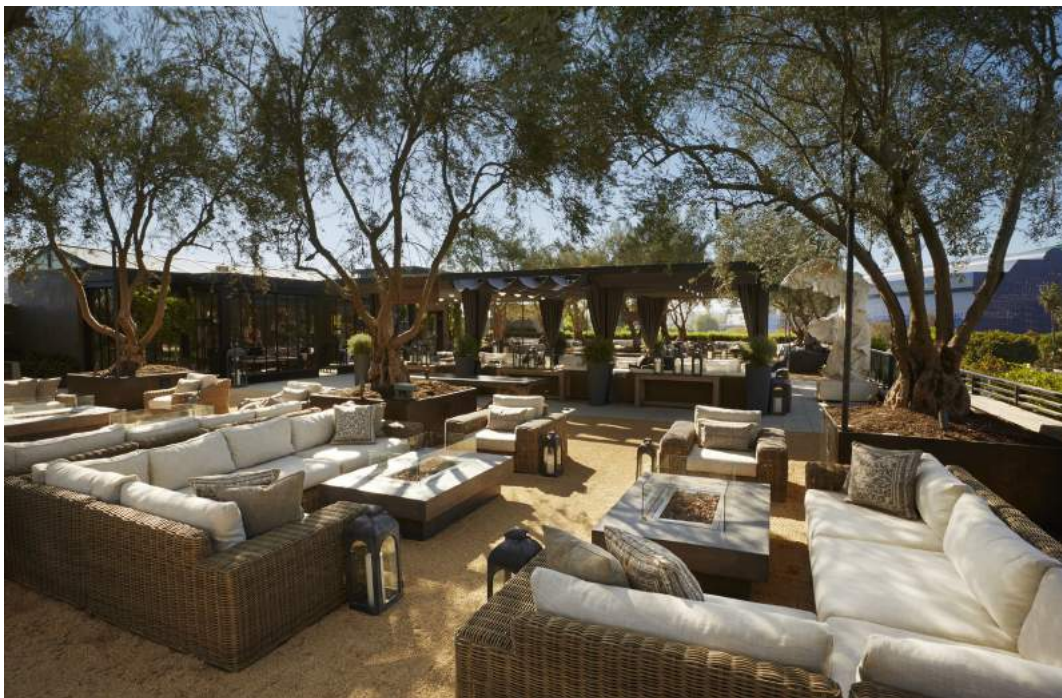
Level 3- The 10,000-square-foot rooftop park symmetrically designed in the spirit of the Jardin des Tuileries, with decomposed granite and a grove of century-old heritage olive trees.