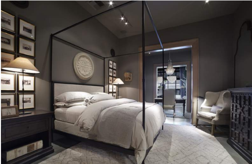
Level 1 - A series of intimate bed & bath suites showcase dramatic compositions.