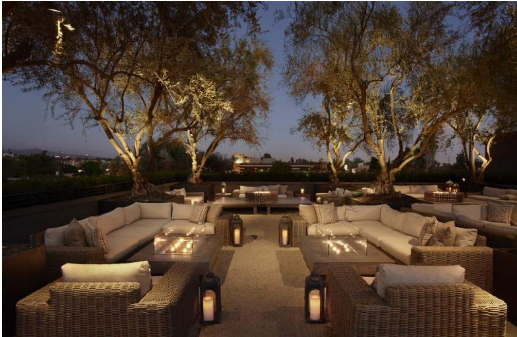
Level 3 - A mix of citrus, fragrant jasmine and French lavender; boxwood hedges and topiaries, glimmering lanterns and trickling fountains surround intimate settings of Outdoor collections.