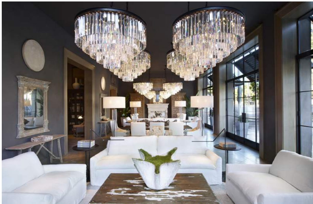
Level 1 - Expansive West Loggia reflects Southern California's temperate climate, with the majority of the Gallery's facade opening to the outdoors.