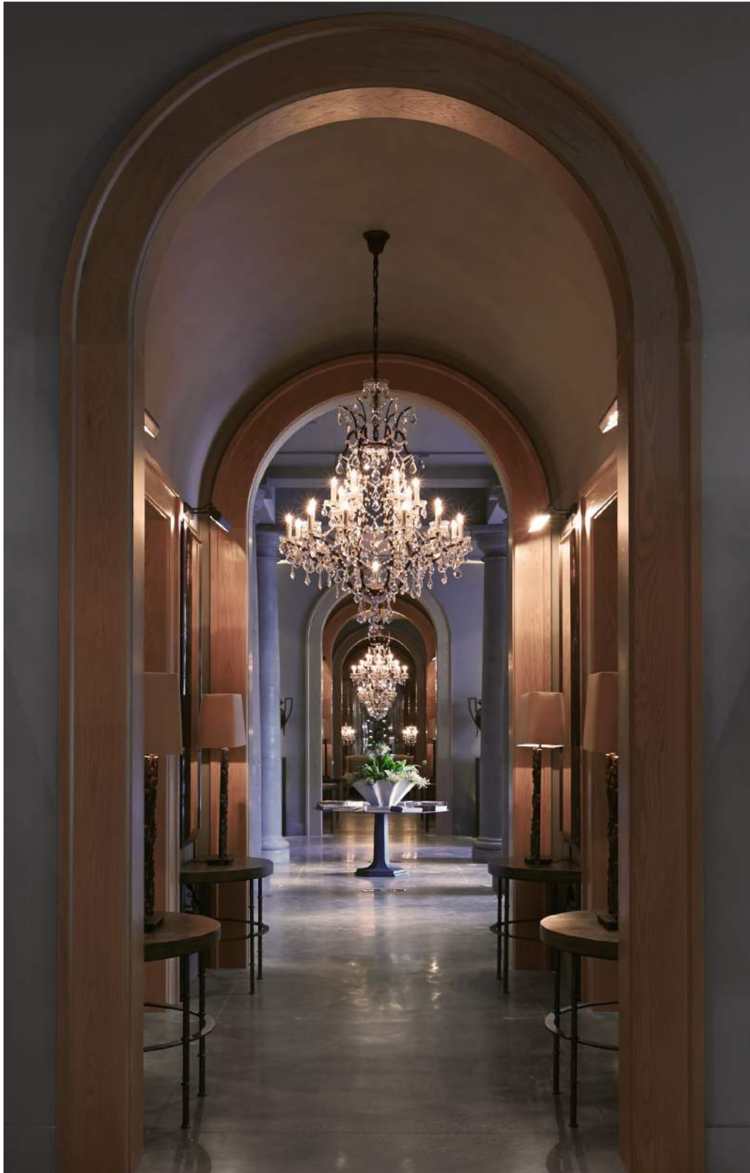
Level-Barrel-vaulted passageways lead to a classical arrangement of rooms with soaring 14-foot ceilings.