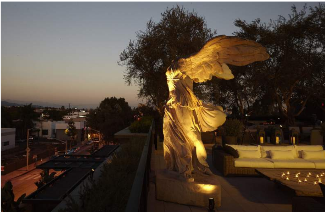
Level 3 - An exacting 10-foot-tall reproduction of the iconic Hellenistic sculpture, Winged Victory of Samothrace, the original of which has long been a highlight at the Louvre.