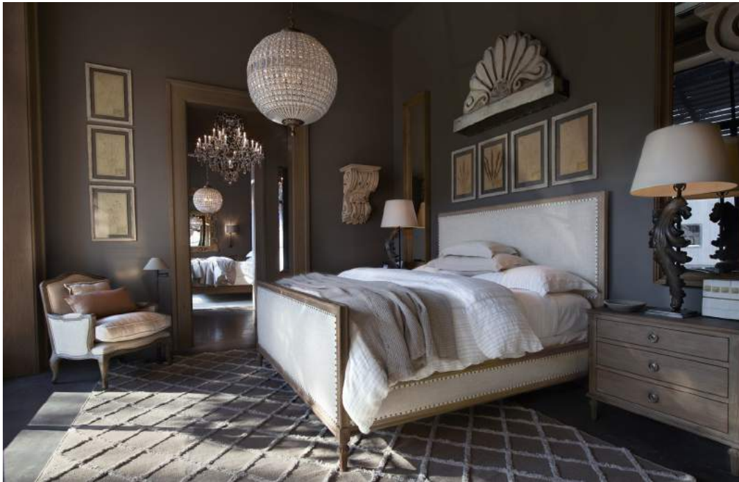
Level 1 - A bed and bath suite is filled with natural light streaming through French doors that open onto a streetscape lined with boxwood topiaries and London planetrees.