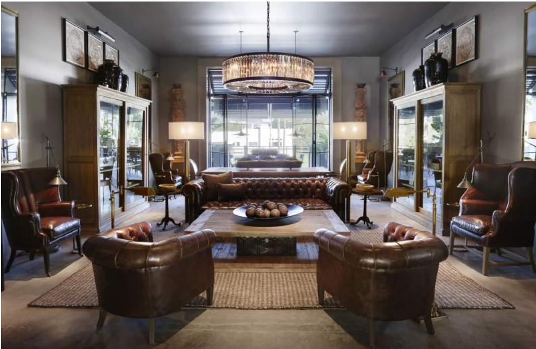
Level 2 - The leather installation opens onto one of the Gallery's two lush garden terraces, which feature tracery metal trellises with billowing canvas.