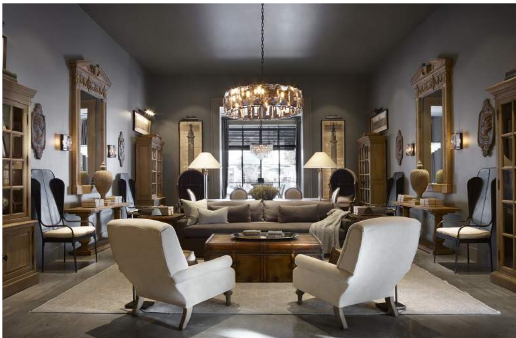
Level 1 – The artistic installation opens onto the Loggia with its retractable glass walls.