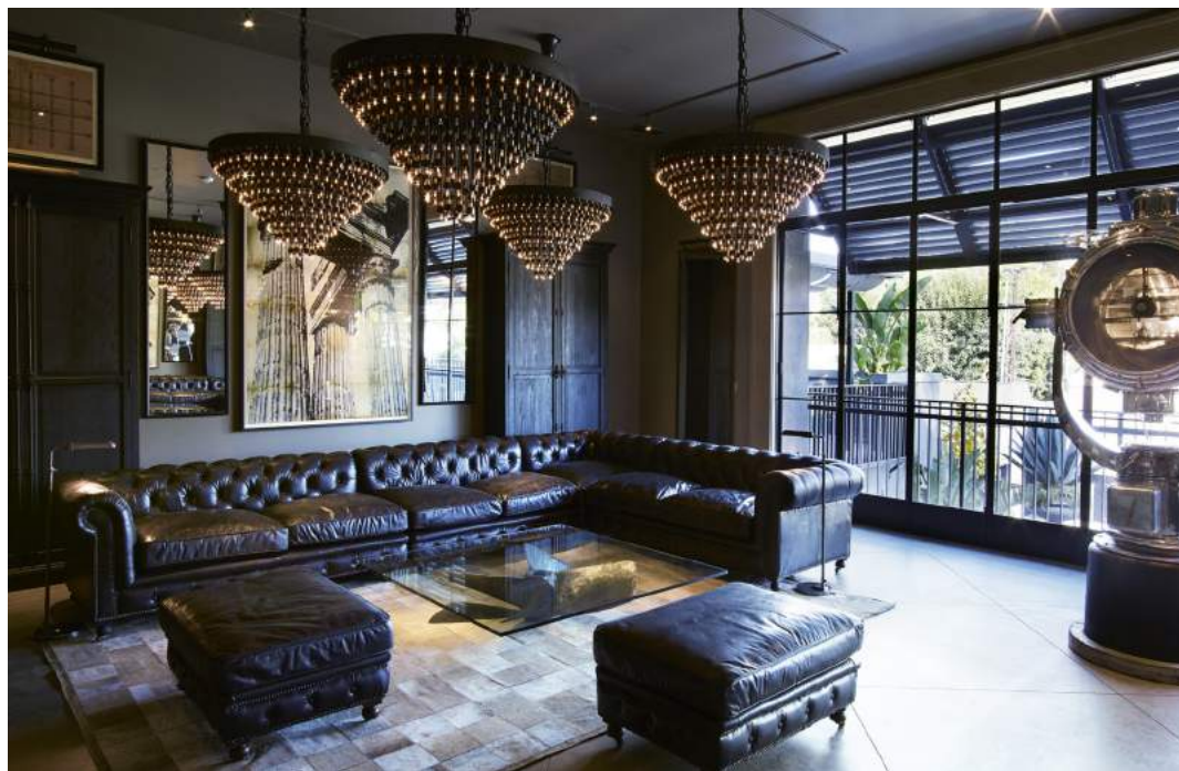
Level 2 - The leather installation opens onto an expansive Juliet balcony through a 28-foot retractable glass wall.