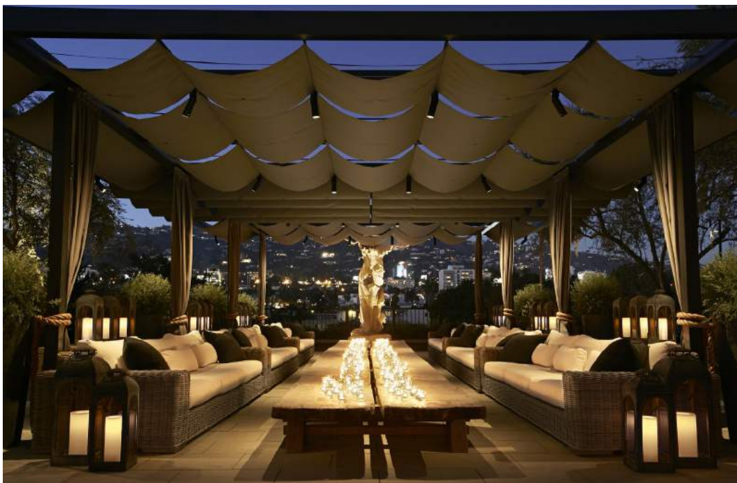
Level 3 - A 40-foot-long table made of two planks of reclaimed pine, culminating with the Winged Victory of Samothrace sculpture and sweeping views of the Hollywood Hills.