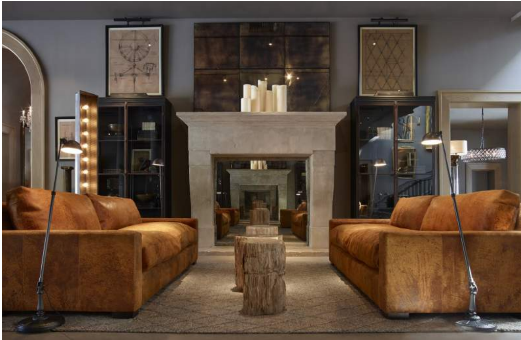
Level 2 - The leather installation reflects craftsmanship from renowned designers and artisans across the globe.