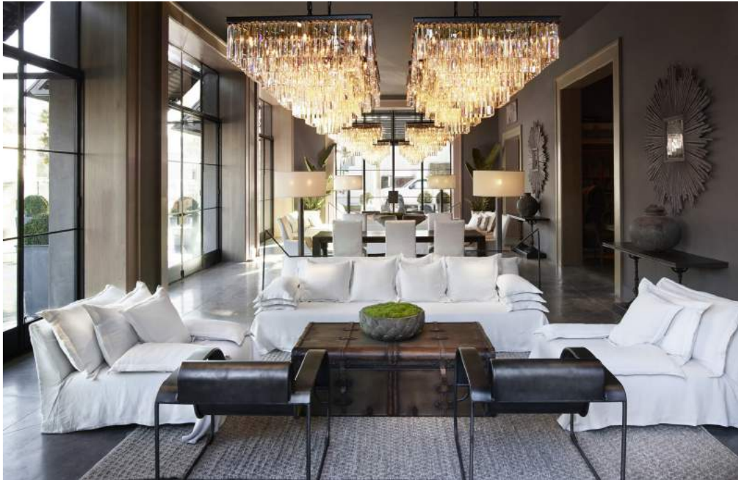
Level 1 - Expansive East Loggia offers a seamless transition between indoors and out, featuring collections from renowned designers and artisans across the globe.