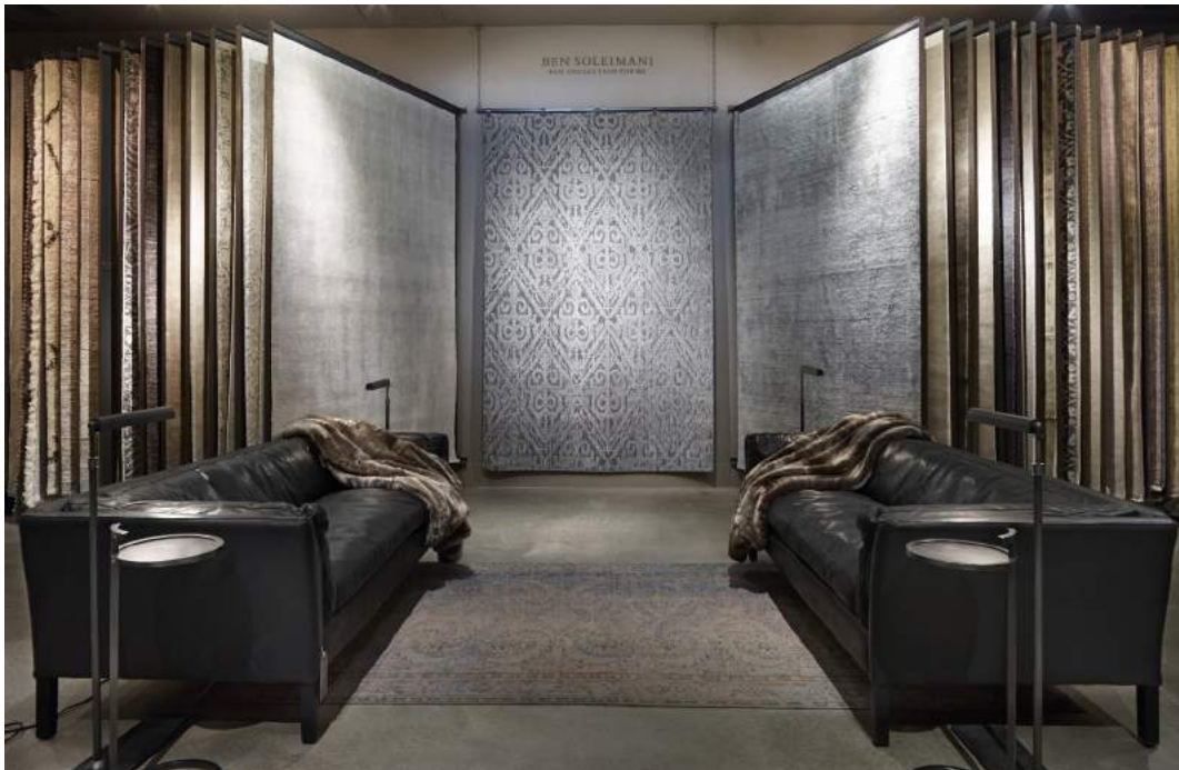
Level 1 – A gallery presentation of curated new and vintage rugs by fourth-generation designer Ben Soleimani.