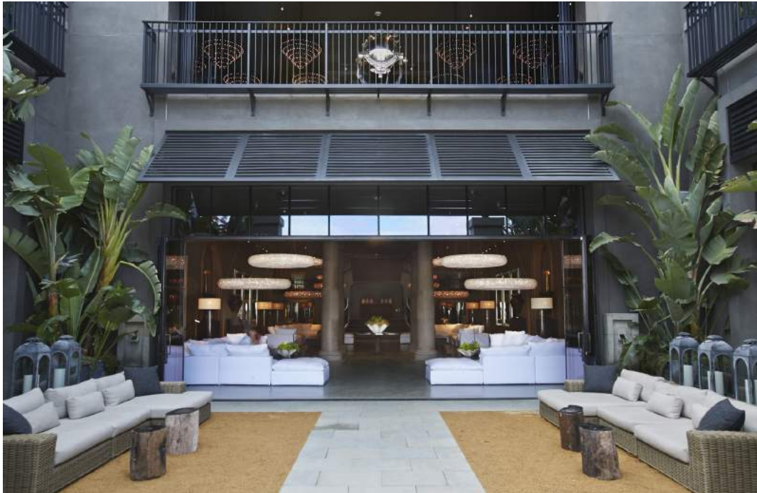
Level 1 - The European garden courtyard with decomposed granite and trickling fountains transitions into the grand entry through 28-foot retractable steel and glass doors.