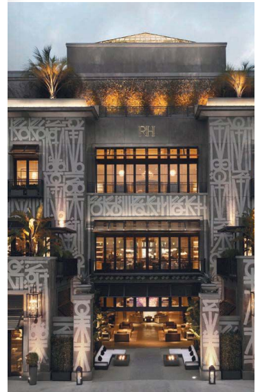
RETNA Mural Installation at the eastern facade of RH West Palm