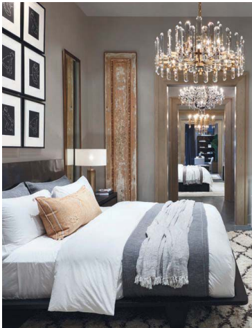
RH Interiors bedroom on level 1 at RH West Palm