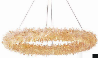
Geode quartz crystal chandelier, from $2,495