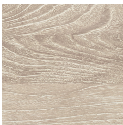
RUSTIC TEAK FINISH (NEW)

We strongly recommend using our custom-fit outdoor covers to protect furniture from the elements and minimize aging.