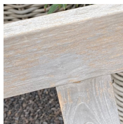
RUSTIC TEAK FINISH (AFTER 1 YEAR)