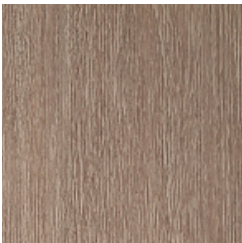
WEATHERED TEAK FINISH (NEW)

We strongly recommend using our custom-fit outdoor covers to protect furniture from the elements and minimize aging.