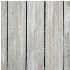
WEATHERED TEAK FINISH (WITH SOME MAINTENANCE)