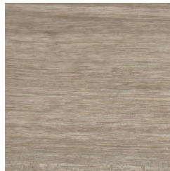
Natural Teak (at 1 year)