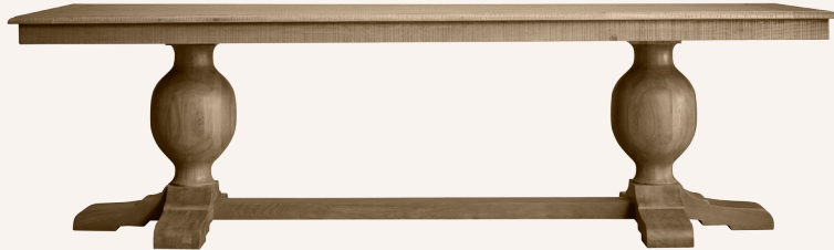
108" Rectangular Table