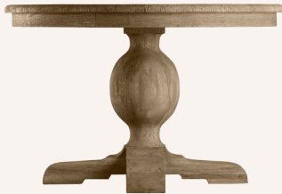
60" Round Table