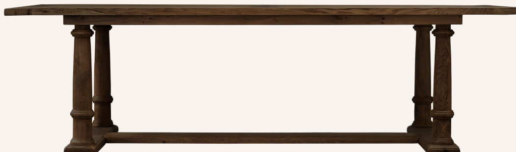
108" Rectangular Table