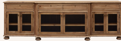
100\"W Glass Media Console