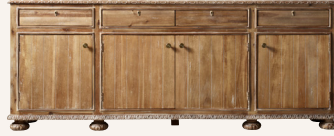
82\"W Panel Media Console