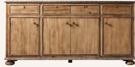
65\"W Panel Media Console