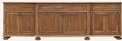
100\"W Panel Media Console