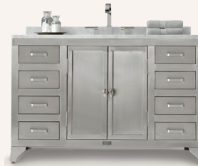
Extra-Wide Single Vanity Sink