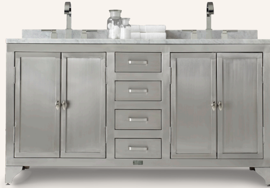
Double Vanity Sink