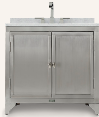
Single Vanity Sink