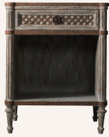
24" Open Nightstand