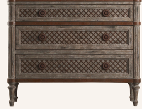
38" Closed Nightstand