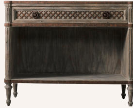
38" Open Nightstand