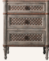
24" Closed Nightstand