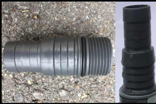
2. Mounted adapter