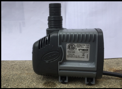
1. Pump mounted