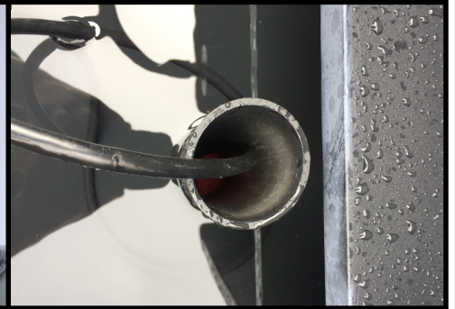
3. Feed plug/cord into hole