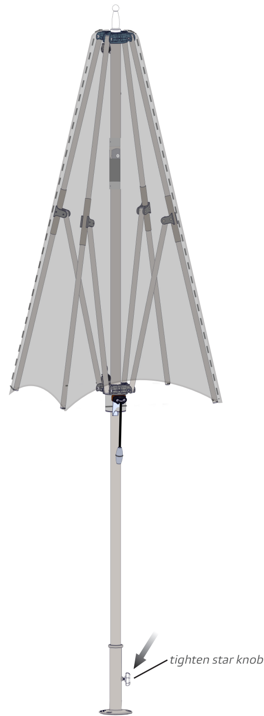
a with above-ground base