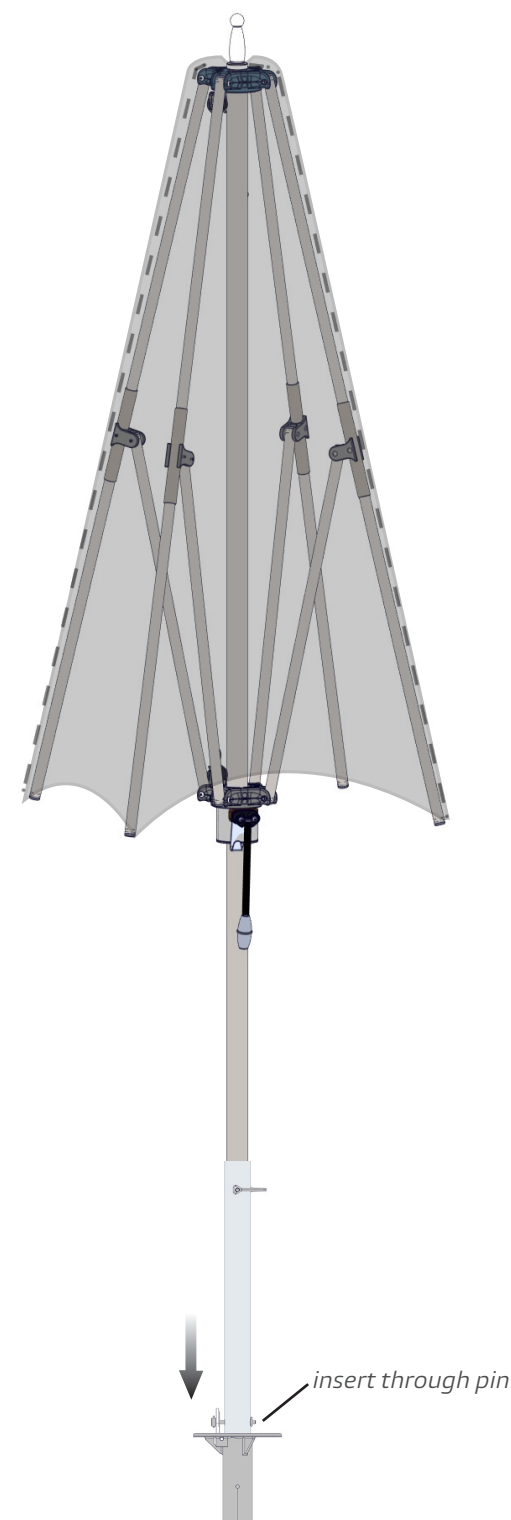
b with in-ground flush mount