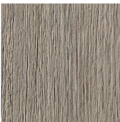
AGED TEAK (NEW)

We strongly recommend using our custom-fit outdoor covers to protect furniture from the elements and minimize aging.